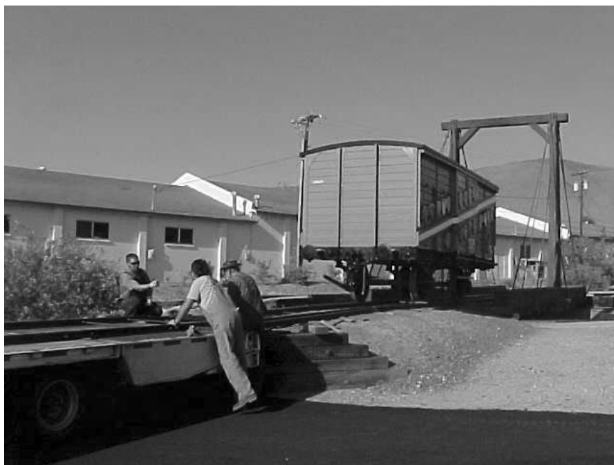
The Restoration Shop staff moves the 40:8 Car onto a flatbed for transport to the Nevada State Museum in Carson City.

The difficulty of building and operating a railroad cannot be overstated. However, it seems that liquidating a railroad was nearly as challenging.