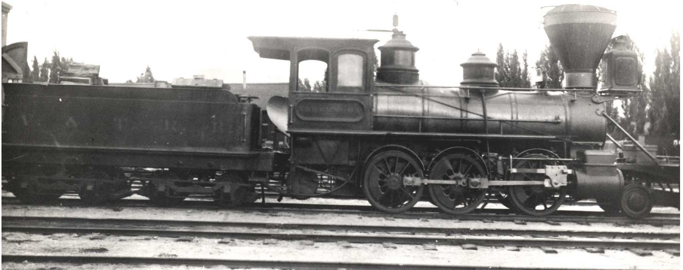
A rare photograph of Virginia and Truckee Locomotive 14, Esmeralda .