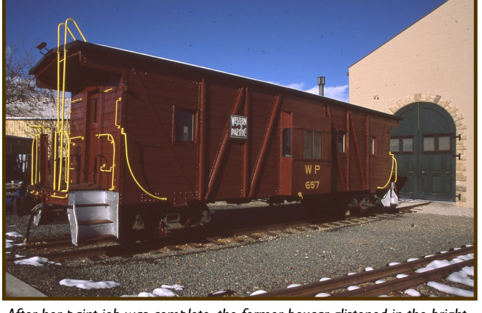
After her paint job was complete, the former boxcar glistened in the bright mid-autumn sun, with new lettering and a WP logo.