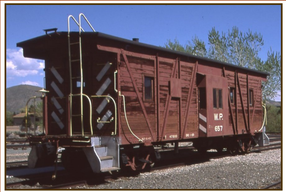
WP caboose no. 657 looked a bit decrepit in early May 2019, before the major painting effort began.

only about $10): The caboose originated more than a century ago as an outside-braced boxcar (WP no. 15637, 1916); conversion to end-of-train service happened during World War II in 1943, and the car remained available for that use until its retirement in 1972.