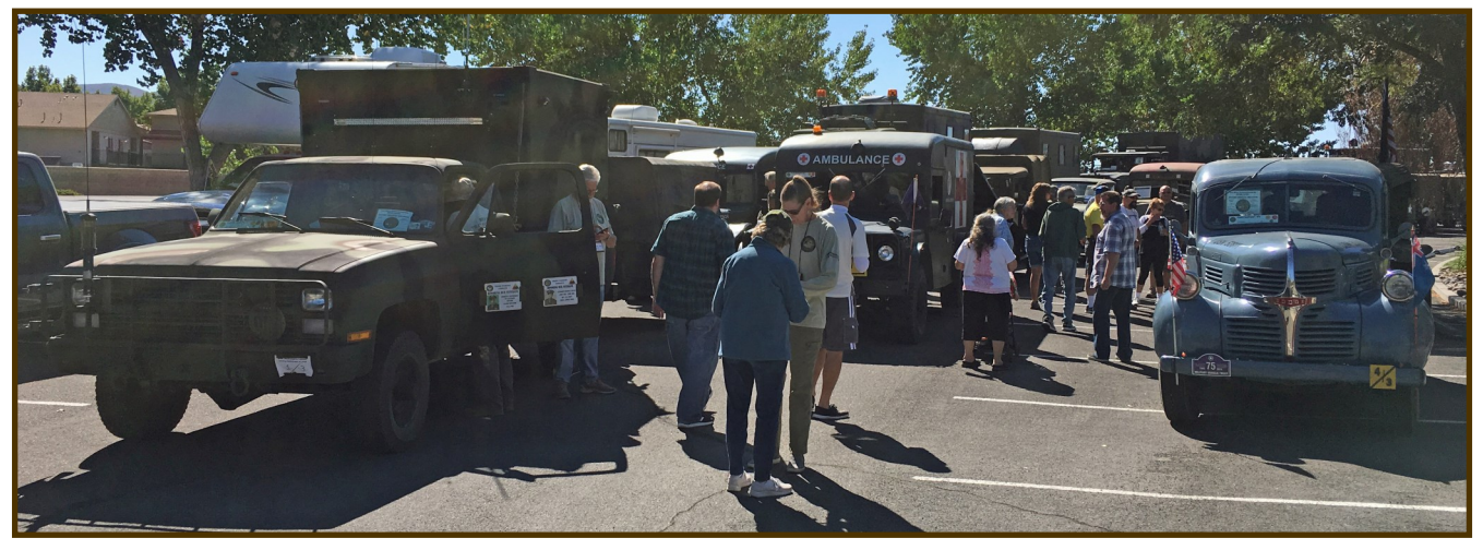
Visitors inspect the MVPA Convoy in the NSRM parking lot on September 12, 2019.

A convoy of vintage military vehicles, making its way cross country to celebrate the 100<sup>th</sup> anniversary of the first U.S. Army Transcontinental Convoy from Washington, D.C. to San Francisco, visited the museum on September 12, 2019.