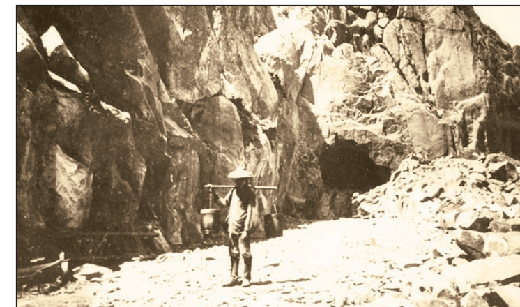
Heading (top cut) of East Portal, Tunnel No. 8

It is often said that every picture tells a story. In history, an image can bring together various source material and combine it all in one clear image. The photograph for this article is from the Alfred A. Hart stenograph collection revealing a scene from the construction of the Central Pacific Railroad through the Sierra Nevada. The photograph depicts an unknown Chinese worker carrying two barrels suspended from a pole upon the worker's shoulders.