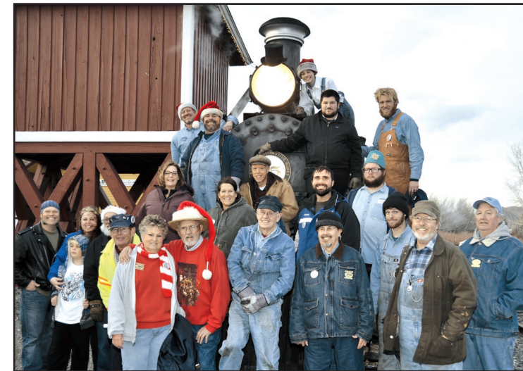
2014 Santa Train Crew & Volunteers

The museum introduced priority boarding to allow visitors the opportunity to purchase their tickets in advance. This helped cut