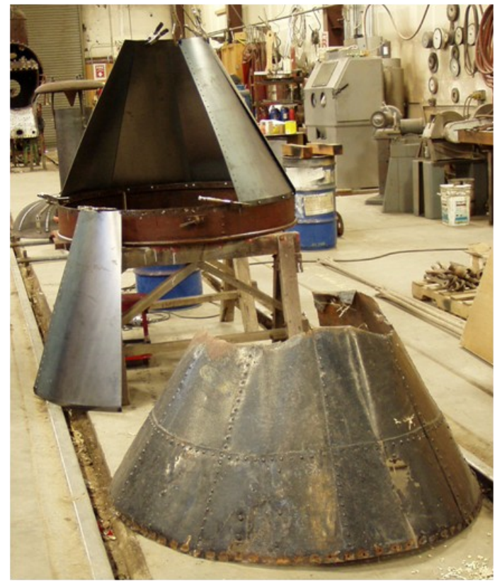
The original stack sits below its replacement. January 2012

A decision was made to replace all boiler staybolts in locations that will be inside the frame of the locomotive when the boiler is reinstalled. Though the staybolts appear to be within specifications, they are original to the locomotive's construction and access to them would be impossible later without the removal of the boiler from the frame. After staybolt holes were repaired and re-tapped, material for staybolts was purchased, cut to length, heat treated, and machined. Work to renew the threads in the washout and blowdown holes was also completed. Dye-penetrant inspection of the throat sheet revealed a defect that the team was able to weld-repair.