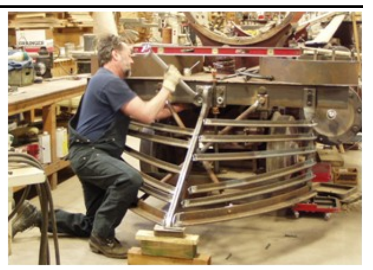
Restoration Specialist Rick Stiver fabricates the new pilot. February 2012

The caulking edges were chipped and ground. The original front tube-sheet was sandblasted and inspected for signs of delamination. It appears to be in very good condition. Although it will require some minor attention prior to installation, it is very serviceable. The smokebox was brought into the shop and set on the cylinder saddle preparatory to laying out the boiler courses. Flagging of the rear tube-sheet was started and is progressing on schedule.