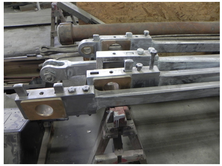
The rods have been fitted with new brasses and bolts. January 2012

Restoration Specialist Mort Dolan, drilling 2" diameter holes in the rear tube sheet for the new boiler tubes. January 2012