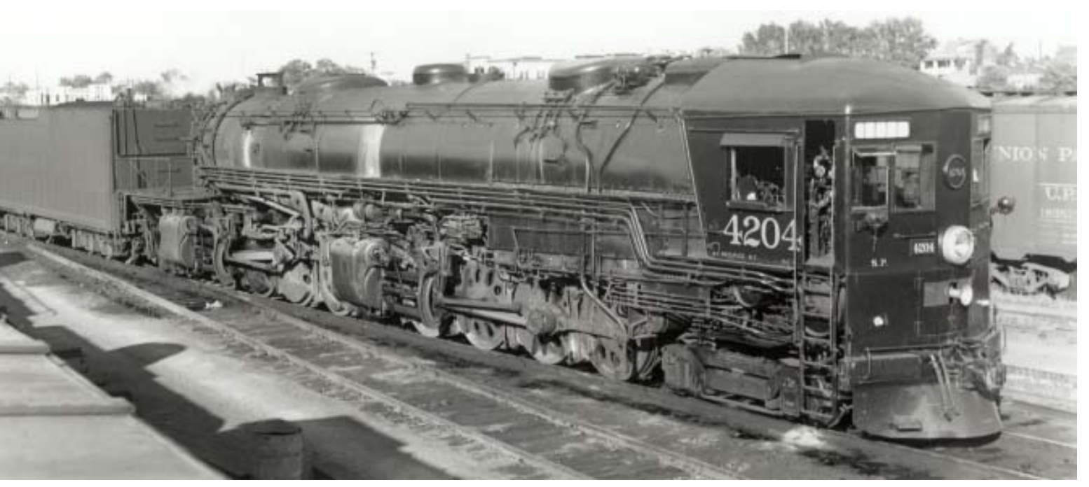
AC-8 No. 4204, Roseville, California, July 1941. Albert C. Phelps photo, Arnold Menke collection.

Our normal hours of business were ten o'clock till three. Twice a month, on Southern Pacific paydays, we opened an hour early and stayed open an hour late, and the workers would cash thousands of paychecks. It was organized mayhem, with block-long lines of men waiting to cash their checks! In order to have enough cash to operate the whole day, we'd have stacks of bills stashed everywhere. We'd have $15,000 in twenties in a wastebasket, and $10,000 in fives lying over here – our drawers were just full of cash! By the end of the day we'd be out of cash and we'd have stacks and stacks of cashed checks, all drawn on a bank in San Francisco where the railroad had its headquarters.