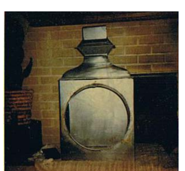
Eureka's partly assembled new headlight in front of the fireplace at the author's home.

At times it was overwhelming. All I could think about was how many parts there were, how much work there was, and how long would it all take and would I ever see the end of it. I realized after a while that if I looked at the entire locomotive, it was overpowering in its ability to scare me and to make me question my sanity for ever having started. Eventually it came to me that if I looked at each part as one small project at a time, then it was really very manageable. All I had to do was keep myself focused on each project, finish it, set it aside, and move on to the next. It was a good analysis of how not to lose your marbles. But there were still an awful lot of parts everywhere that had to be done.