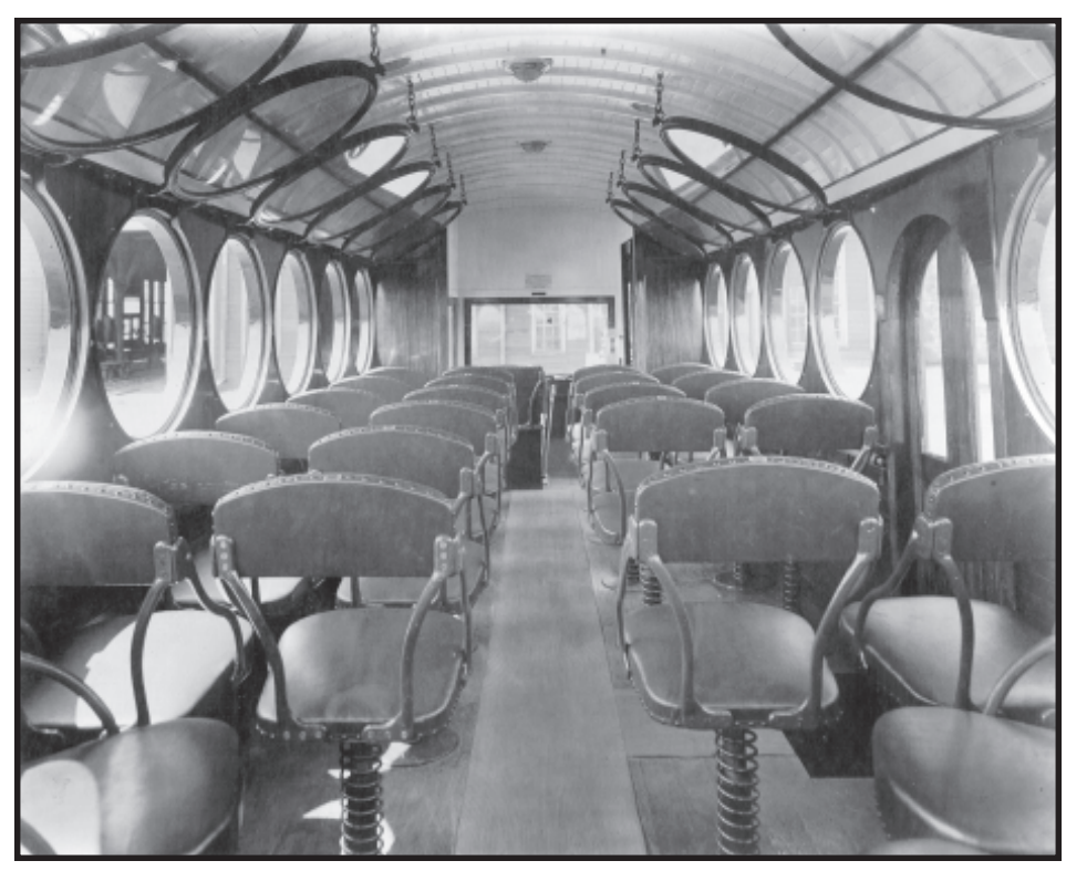
Interior of the McKeen chair car. Note the unusual suspension. Photo from the George N. Andrews Collection. NSRM

Re-examination of some of the drawings are now beginning to make sense in light of what we are learning, however the one we want is always the one that has the smudged detail or ambiguous reference. As an example, Restoration Specialist Lee Hobold has been spending a great deal of time trying to decipher the construction details of the engine room woodwork. Examination of the existing components and their location in the engine room has caused some confusion. Examination of the McKeen drawings prior to any work leads to additional confusion. But after the reconstruction is completed the drawings make perfect sense, even though the design doesn't. It would appear that the