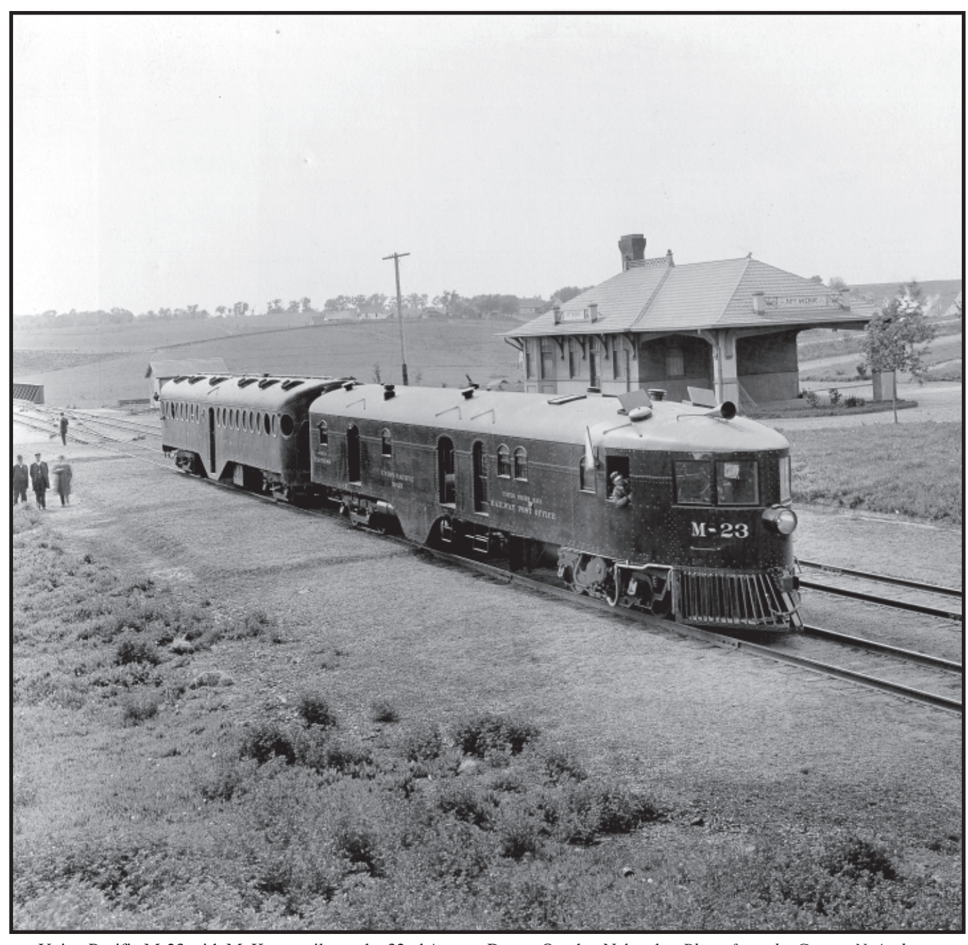
Union Pacific M-23 with McKeen trailer at the 32nd Avenue Depot, Omaha, Nebraska.